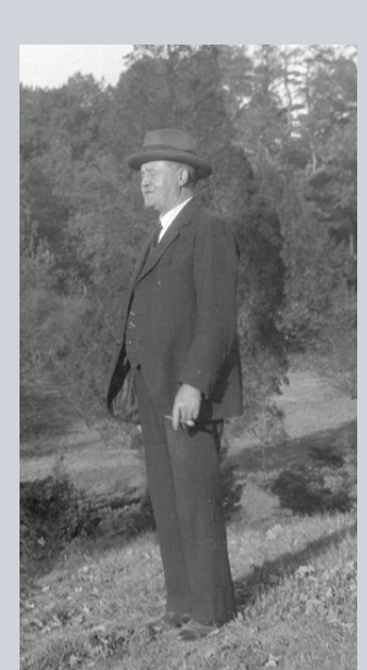
Reginald Farrer in bizarre costume,

it was a risky job for the plant hunters and their local teams; walking in hobnailed boots up to 4.500 metres (15.000 feet) and facing extreme weather, deadly insects, blood thirsty leeches and civil unrest. The other risk was that many seeds collected did not survive the